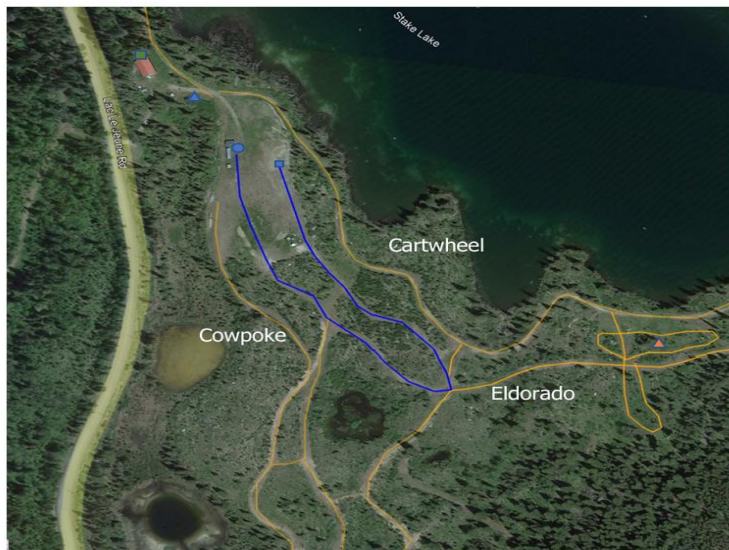
Overlander Ski Club 0.6km Course