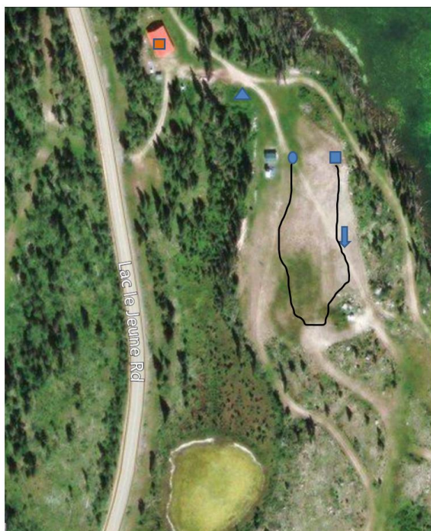
Overlander Ski Club - 300m Course